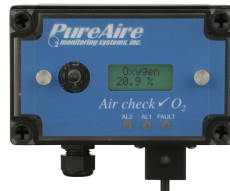
Oxygen Deficiency Monitor