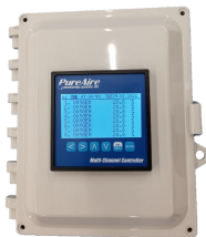
8 Channel Programmable Controller for O 2 or Gas Monitors