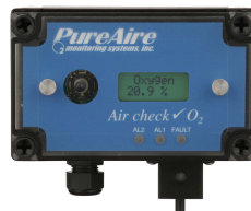
Oxygen Deficiency Monitor