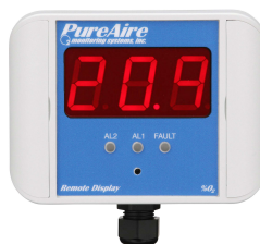
Remote Digital Display ITEM #: 99091