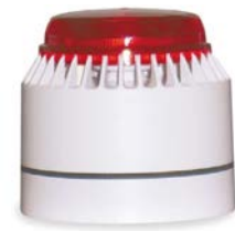
Red Horn/Strobe ITEM #: 42002