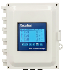
8 Channel Programmable Controller for O2 or Gas Monitors ITEM #: 99196