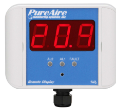
Remote Digital Display