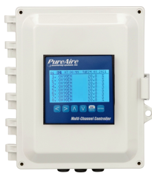
8 Channel Programmable Controller for O2 or Gas Monitors