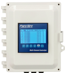
8 Channel Programmable Controller for O2 or Gas Monitors