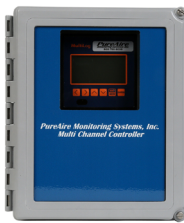
8 Channel Controller for Gas Monitors