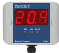
Remote Digital Display