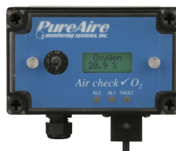
Oxygen Deficiency Monitor ITEM #: 99016