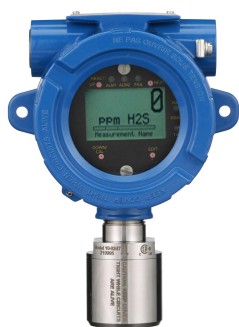
ST-48 Combustible Gas Monitor