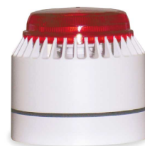
Red Horn/ Strobe 24VDC ITEM #: 42002