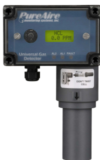
Universal Gas Detector ITEM #: 99030