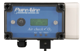
Dual O2/CO2 Monitor