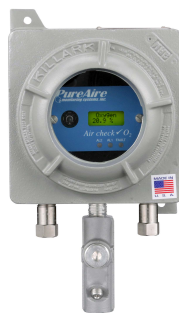
Explosion Proof Oxygen Monitor