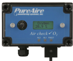
Oxygen Deficiency Monitor