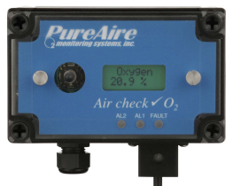
Oxygen Deficiency Monitor

Example of Compatible Monitors-Please contact PureAire for a complete list