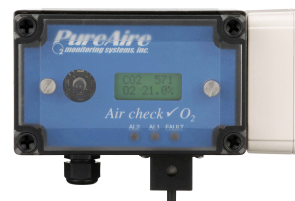
Dual O2/CO2 Monitor