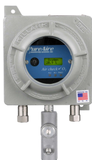
Explosion Proof Oxygen Monitor