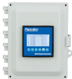
8 Channel Programmable Controller for O2 or Gas Monitors