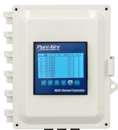
8 Channel Programmable Controller for O2 or Gas Monitors