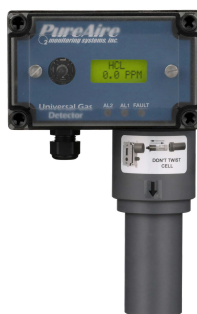
Universal Toxic Gas Detector